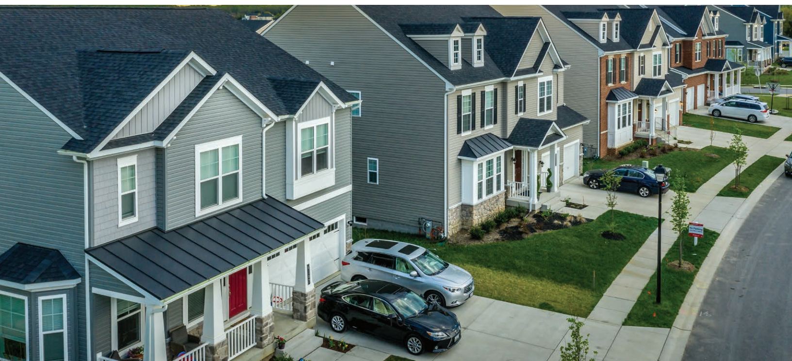
Figure out how much you can afford before you start looking for your dream home, let's find out how big you can dream. Knowing your true budget is the first and most important step in buying a home. A home is a big purchase. It's probably the most expensive thing you'll ever buy, and there are lots of expenses you might not even know about. Some of them include: cost of buying a home = one time costs, down payment, legal fees, title insurance, inspection fees, property transfer taxes + monthly costs, mortgage, utilities maintenance, insurance, and property taxes.

What you will need prior to our first meeting: